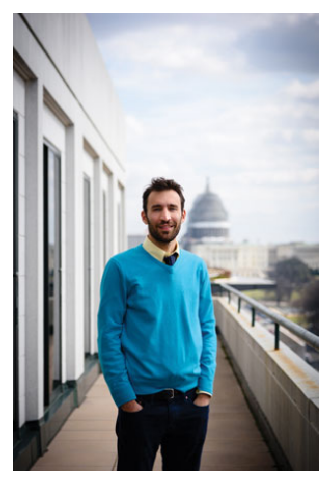
"I was ... watching people stuck in jail because they couldn't pay $200 bail. ... if anything, the principle is even stronger in the pretrial context. You haven't been convicted of anything yet." — Alec Karakatsanis

"In so many instances, an indivi-dual's access to justice has become predicated on their ability to literally pay for it," she said during a speech in December at the White House Convening on Incarceration and Poverty. "When bail is set unreasonably high, people are behind bars only because they are poor."